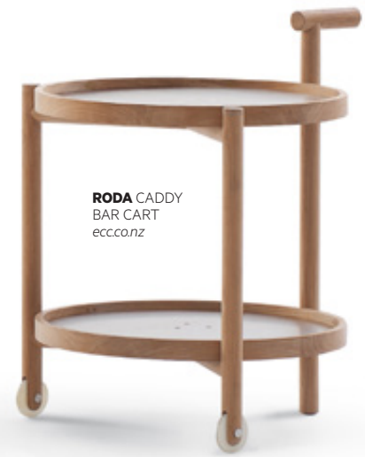
RODA CADDY BAR CART ecc.co.nz