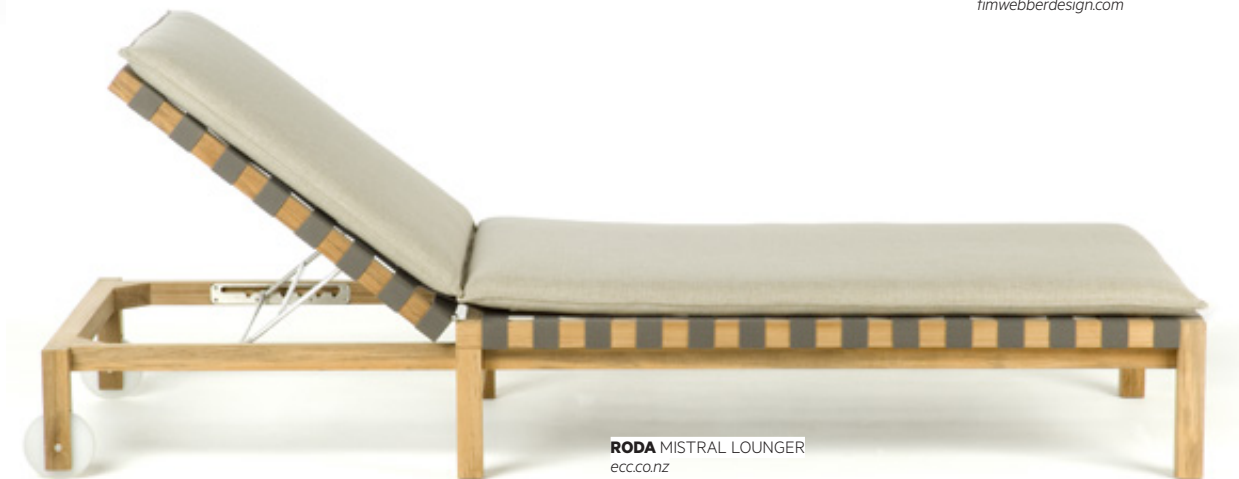
RODA MISTRAL LOUNGER ecc.co.nz